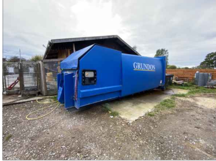
Picture taken towards compactor and stables