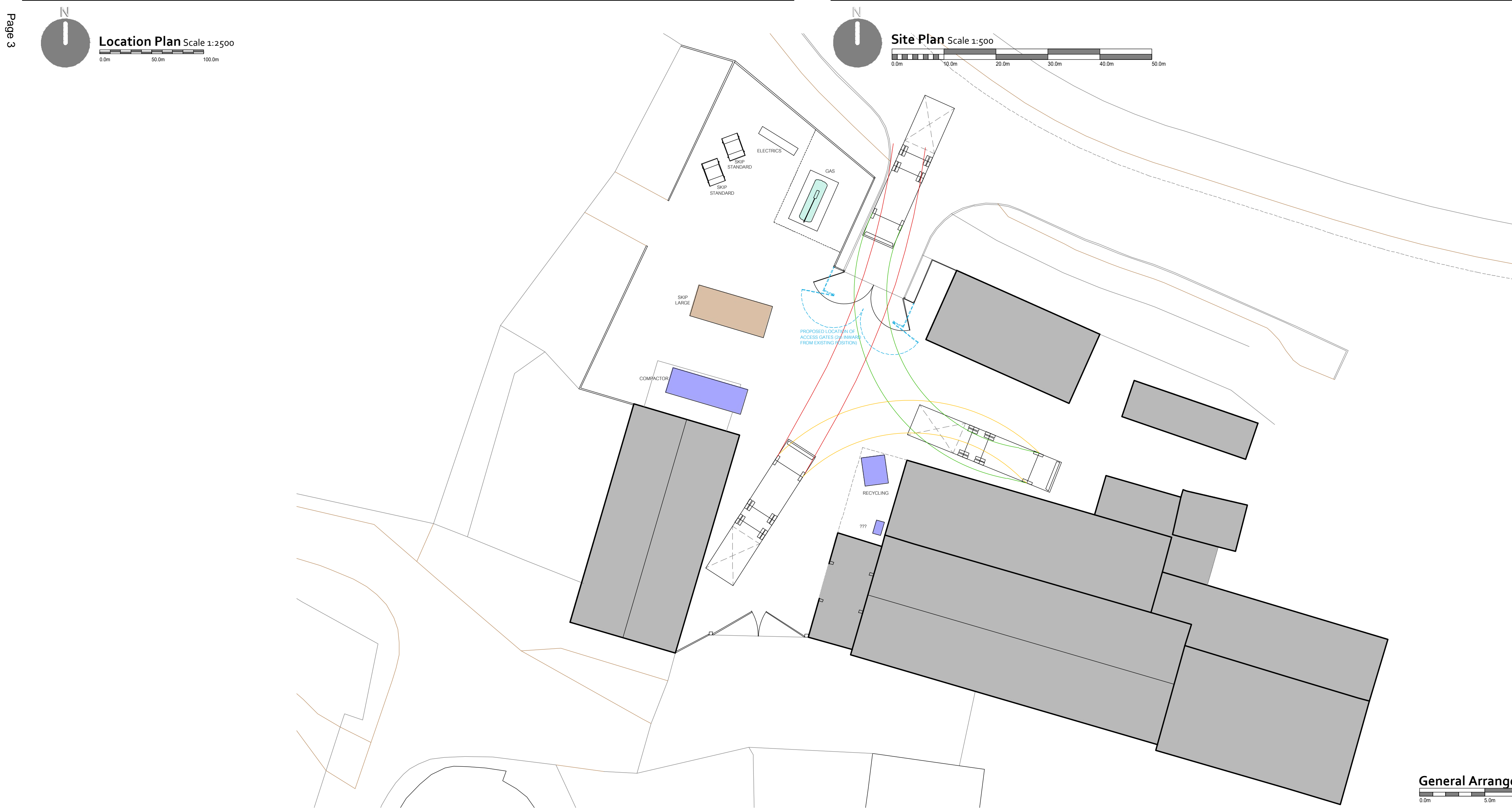
General Arrangement Plan Scale 1:200