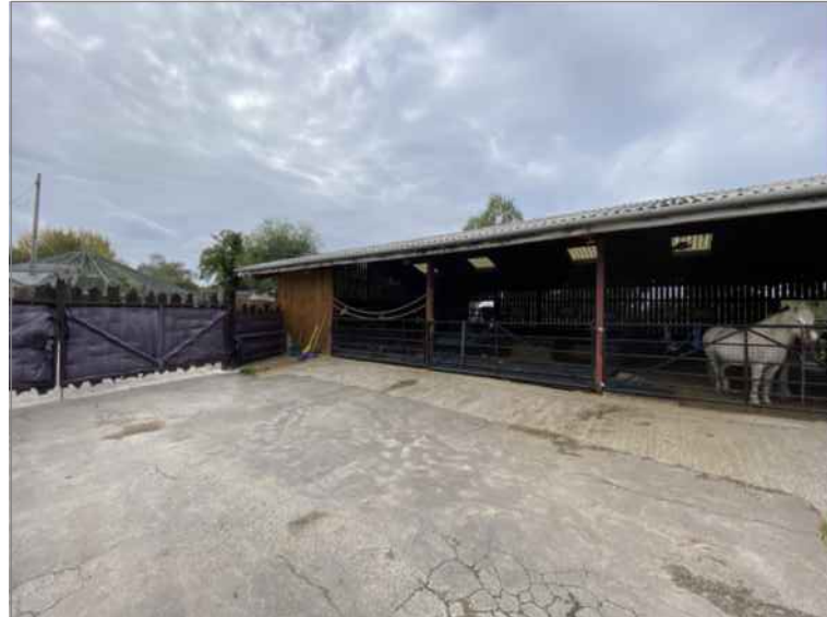
Picture taken towards stables