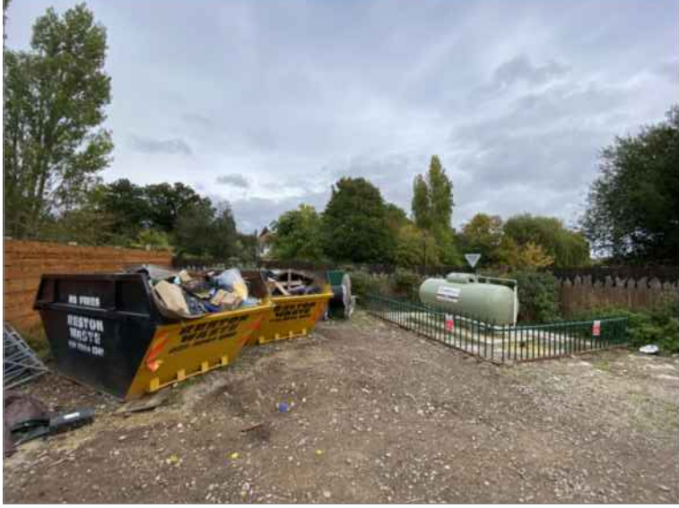
Picture taken towards front boundary and gas cylinder