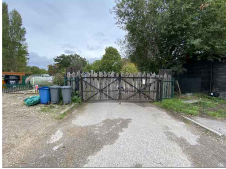
Picture taken towards external access gate