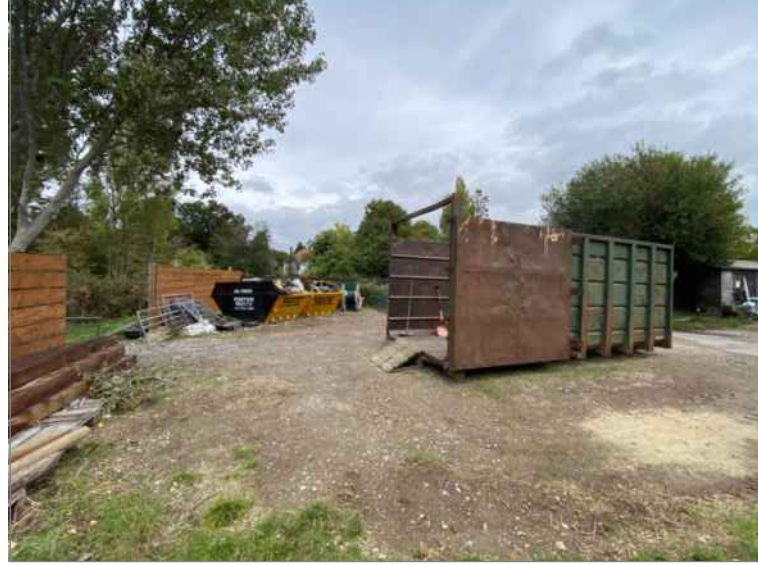
Picture taken towards side / front boundary