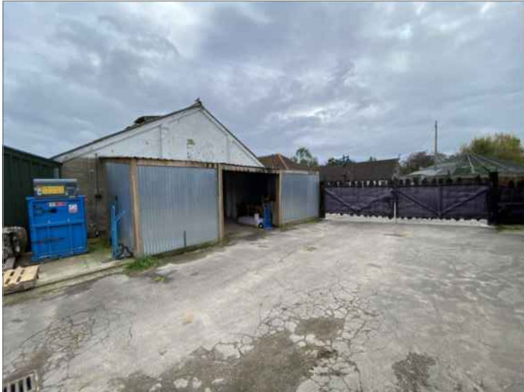
Picture taken towards internal access gate