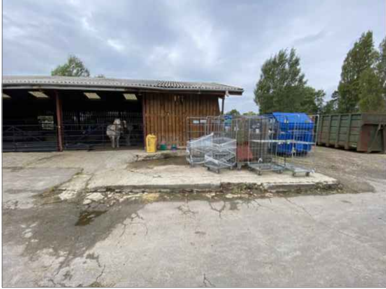
Picture taken towards stables and compactor