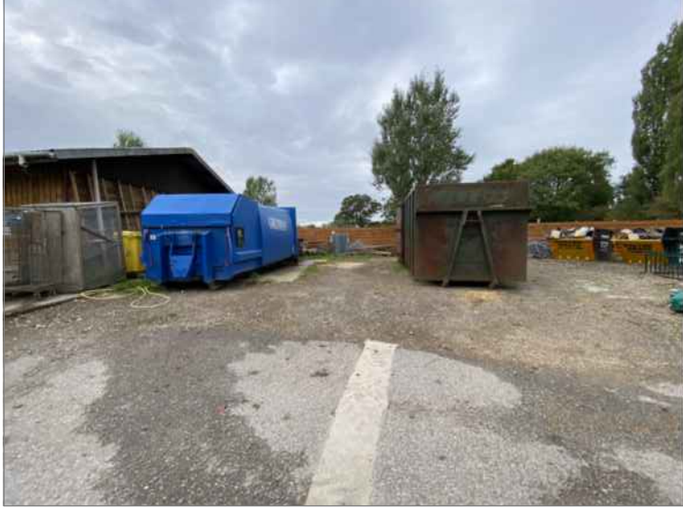
Picture taken towards compactor and large skip